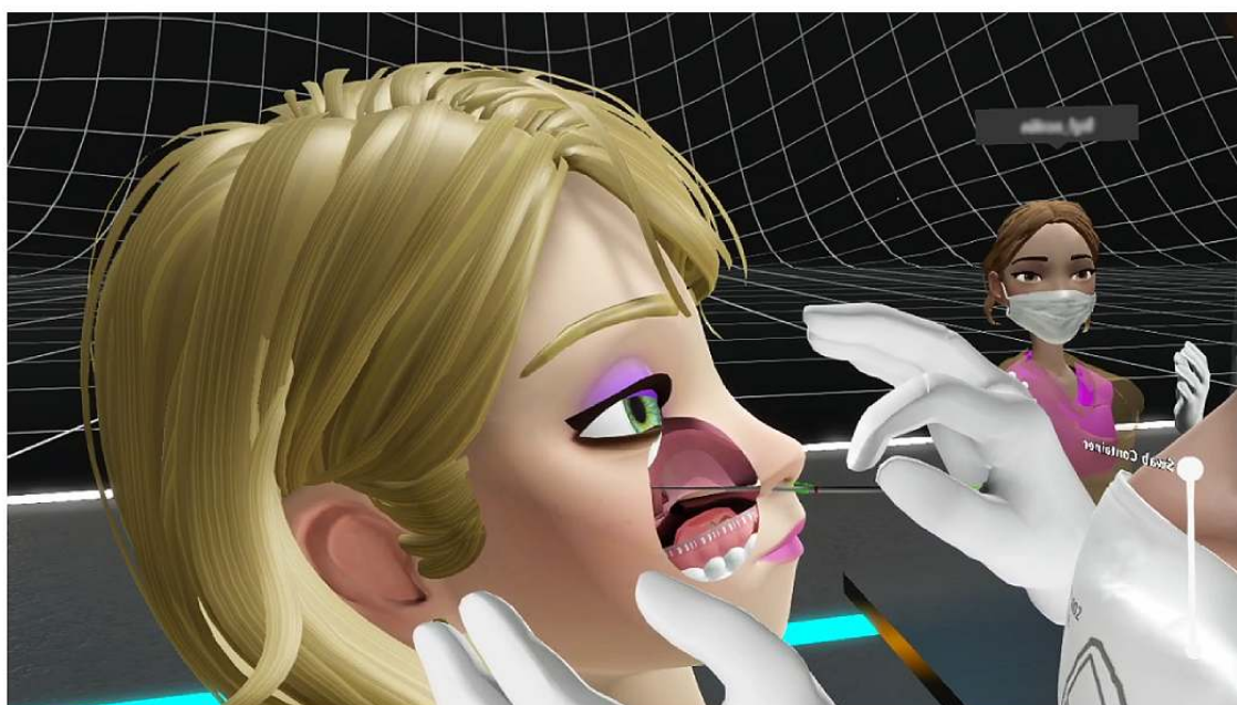
Figure 4. Screenshot of the virtual reality (VR) application, Covid-19 VR Strikes Back, showing the taking of a nasopharyngeal swab.

The participants performed two runs in the simulation using the single player modus.