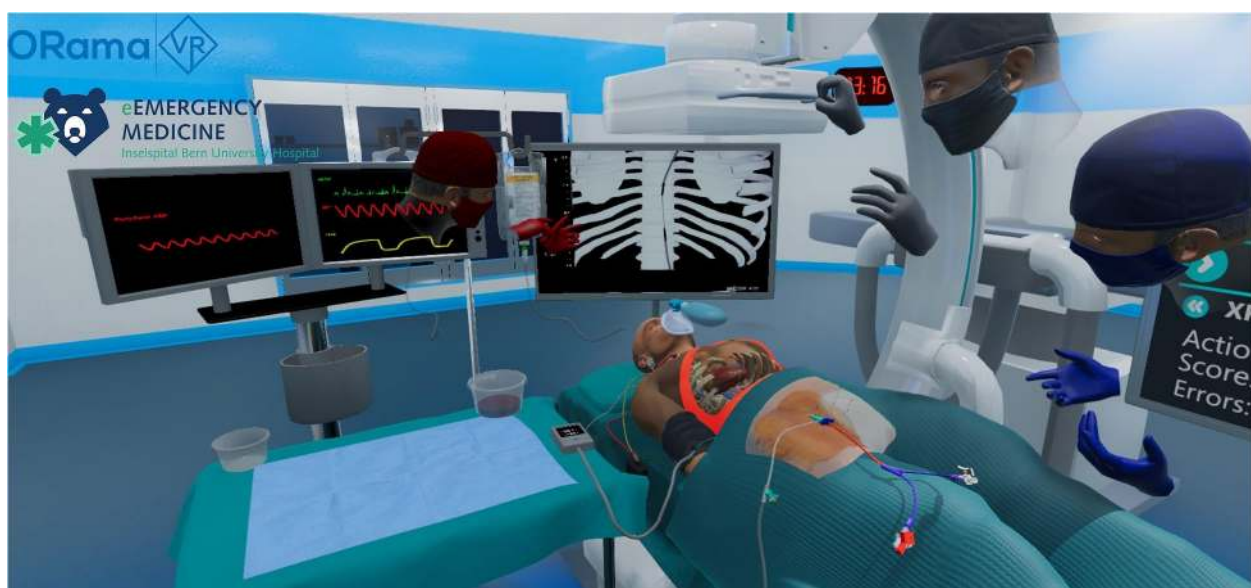
Fig. 2 Screenshot of the VR REBOA simulation. Patient monitored in the resuscitation bay, REBOA catheter in situ after successful insertion

procedural step; these prompts were missing in the normal mode.