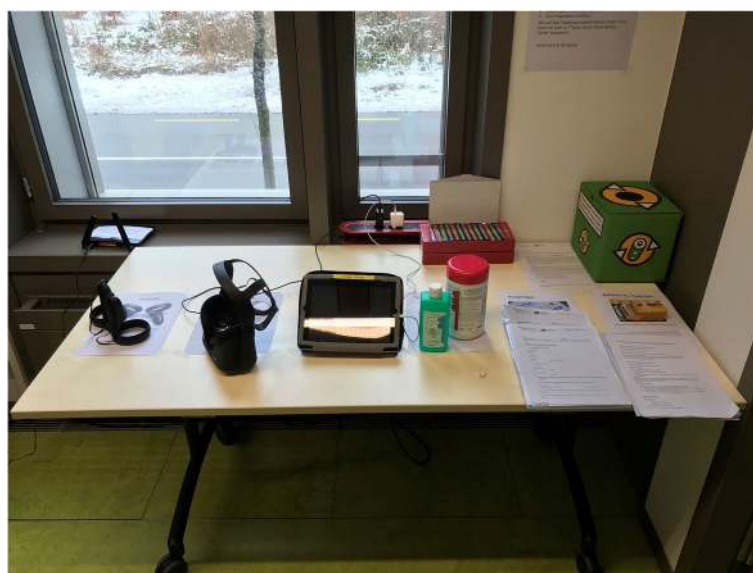
Fig. 3 Setup of the VR simulation. Setup for the VR REBOA simulation including hand-held controllers, head-mounted device (Oculus Quest), tablet PC, disinfection materials

Usability was assessed using the System Usability Scale (SUS) [26], which is composed of 10 questions with a 5-point Likert attitude scale and the After-Scenario Questionnaire (ASQ) [27], which assesses the ease of task completion, satisfaction with completion time and